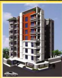
Aramaic South Home 298-299, South Paikpara, Mirpur, Dhaka-1216.