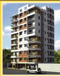
MHM ROIS GARDEN 229/1, South Paikpara, Mirpur, Dhaka-1216.

Dear Customer, Welcome to MHM Properties LTD. By the grace of Almighty, it is our great pleasure to announce our apartment project "MHM ROIS GARDEN". This is positioned in one of the conveniently located suburb in Dhaka city. The excellent care and enormous efforts of our highly professional engineers and architects will glorify the project as one of the mile stone in Dhaka city. In Sha Allah , We hope to deliver the project before our committed time frame. The project is located to all essential amenities- Mirpur road, 60 fit high way road, Gabtoli Bus stand, Ibsina Hospital, Shyamoli shishu park, Agargoan IDB Bhobon, Kallanpur Girls School and College and so on. It is our pleasure to invite you to visit our project and feel your dream come true.