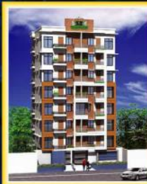
Aramaic Palmoni House # 8/9, Lane-2, Section 10 Mirpur-10, Dhaka-1216.