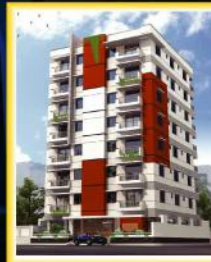
MHM-AL-HERA 428/C, Garden View Road, South Paikpara Mirpur, Dhaka-1216