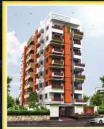
Aramaic South Breeze 359, 363 South Paikpara, Mirpur, Dhaka-1216