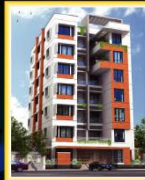
MHM-ARA NOOR CASTLE House # 728, Block-G, Afroza Begum Road Bashundhara, Dhaka.