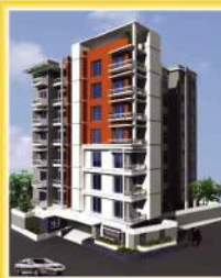
Aramaic South Home 298-299, South Paikpara, Mirpur, Dhaka-1216.