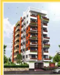
Aramaic South Breeze 359, 363 South Paikpara, Mirpur, Dhaka-1216