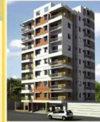
MHM ROIS GARDEN 229/1, South Paikpara, Mirpur, Dhaka-1216.