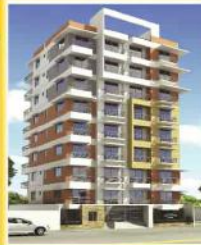
MHM-AL-HERA 428/C, Garden View Road, South Paikpara Mirpur, Dhaka-1216

I t is our pleasure to invite you to visit our project and feel your dream come true.