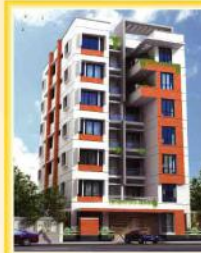
MHM-ARA NOOR CASTLE House # 728, Block-G, Afroza Begum Road Bashundhara, Dhaka.