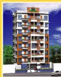
Aramaic Palmoni House # 8/9, Lane-2, Section 10 Mirpur-10, Dhaka-1216.